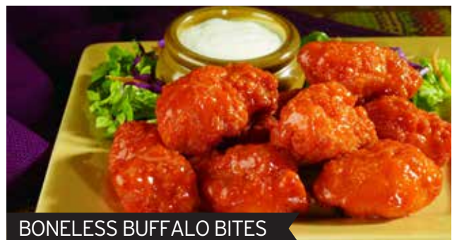
BONELESS BUFFALO BITES